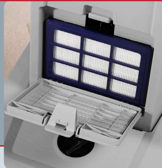
A HEPA 13 filter is optional for all models in this series so that the machine can be used where maximum dust filtration is required